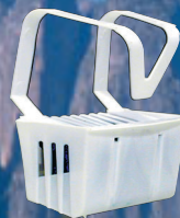
Toilet Bowl Rim Hanger