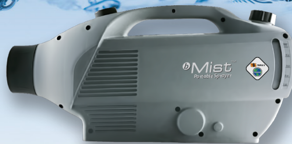
Item # 24013