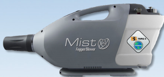
Item # 24004