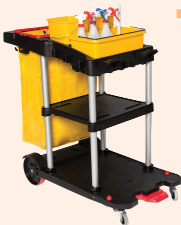
Dock 'n Lock Janitor Cart