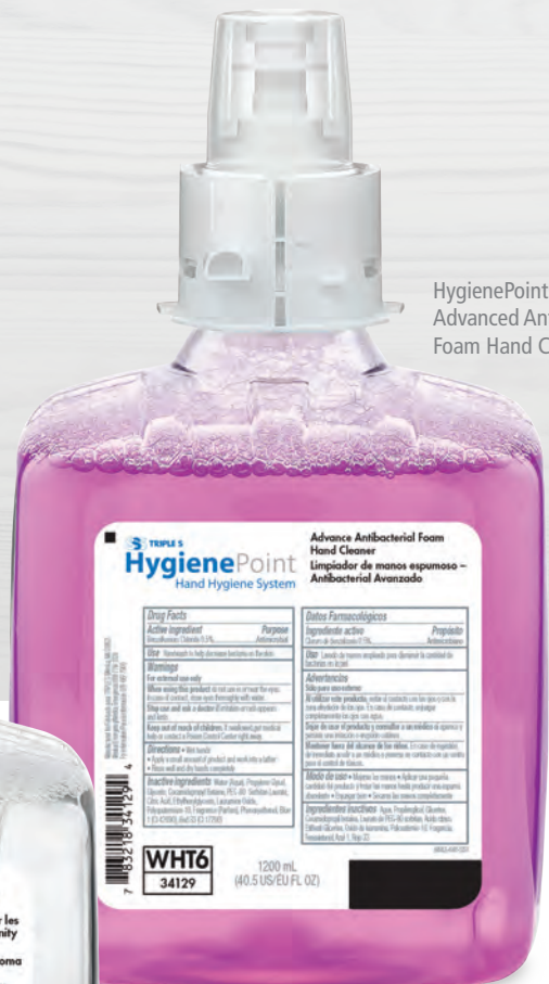
HygienePoint Advanced Antibacterial Foam Hand Cleaner