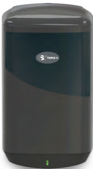
TFE ENERGY-ON-THE-REFILL AND COMMUNICATION CAPABLE

Touch-free systems built for reliable performance and maintenance ease.