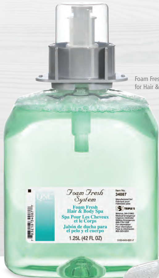
Foam Fresh Spa Foam for Hair & Body

Choose foam soap, antibacterial foam soap, or shower soap. Unlike regular soap, Ultra Clean Foam Hand Soap removes over 99% of dirt and germs 1,2 – without the use of antibacterial ingredients! 3