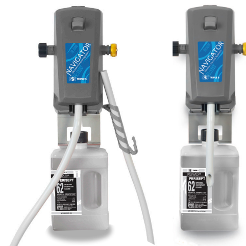
Bucket Fill #23202