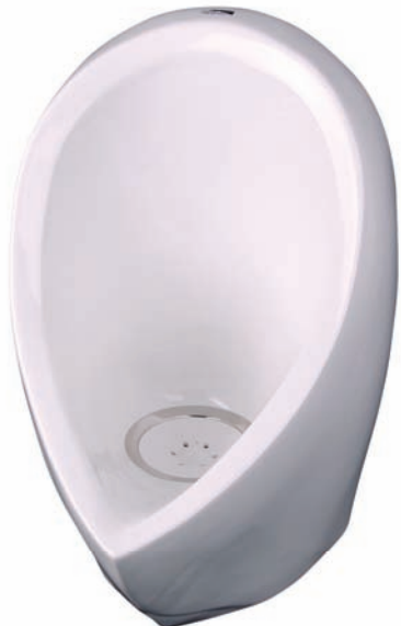
Model 201 Item No. 87002