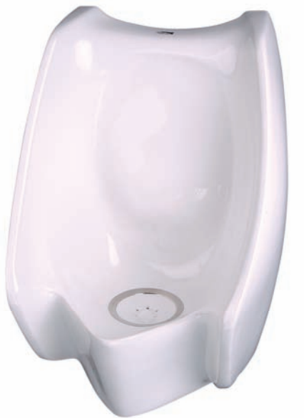
Model 101 Item No. 87001

OUR SLEEK MODERN DESIGNS HELP REDUCE SPLASH AND KEEP FLOORS DRIER.