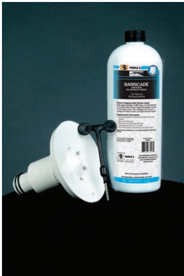
Replacement Kit Item No. 87003