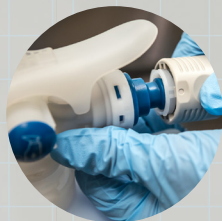
1. Click Quick connect refill bottle to water supply