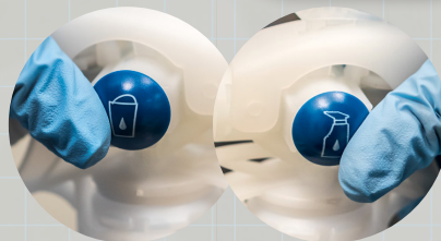
2. Select Choose bottle or bucket fill mode