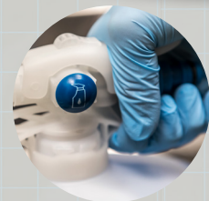
3. Dispense Squeeze handle trigger to dispense solution